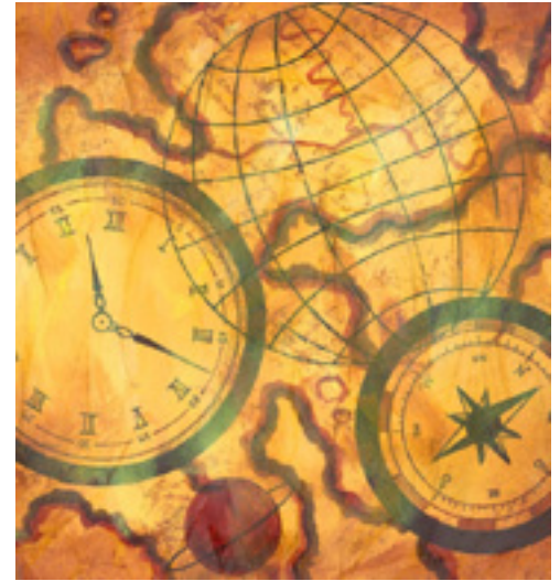
Creativity goes a long way on your commute.