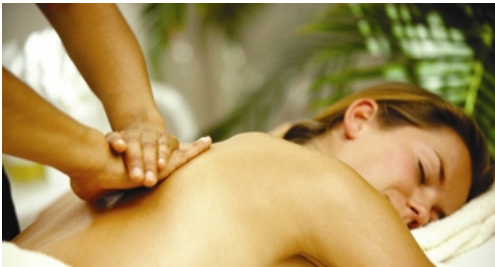
The more often you receive massage, the more therapeutic it becomes.

How often you receive massage depends on why you're seeking massage. In dealing with the general tension of everyday commutes, computer work, and time demands, a monthly massage may be enough to sustain you. On the other hand, if you're seeking massage for chronic pain, you may need regular treatments every week or two. Or if you're addressing an acute injury or dealing with high levels of stress, you may need more frequent sessions. Your situation will dictate the optimum time between treatments, and your practitioner will work with you to determine the best course of action.